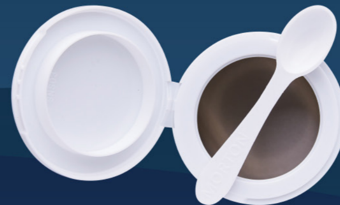
Full Open With Scoop