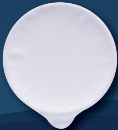
White Paper Membrane