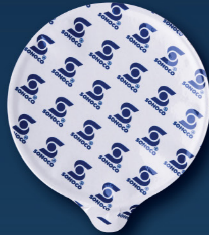
Continuous Printed Membrane