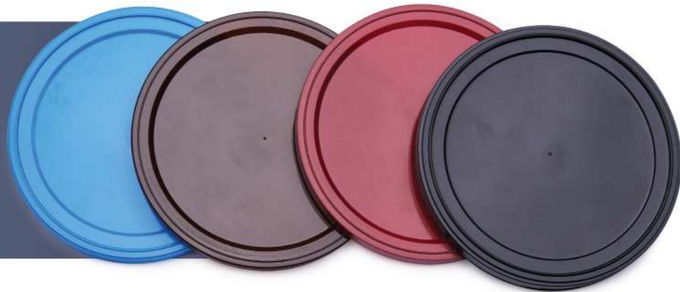
3 | Embossed Overcap