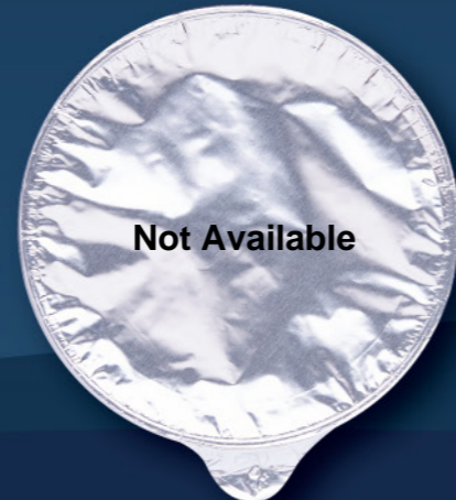
Plain Foil Membrane